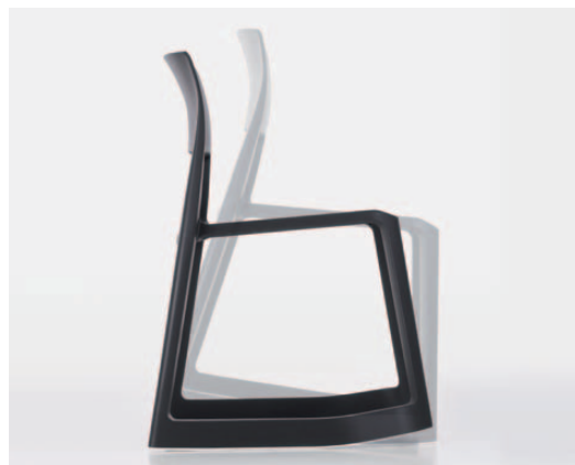
Pressure is removed from the lower spine in the forward-tilt sitting position.