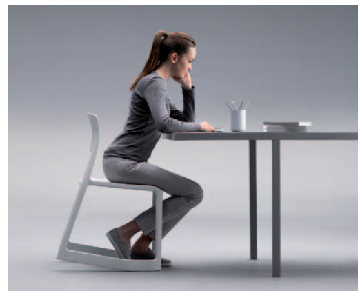
The nine-degree forward inclination straightens the back.