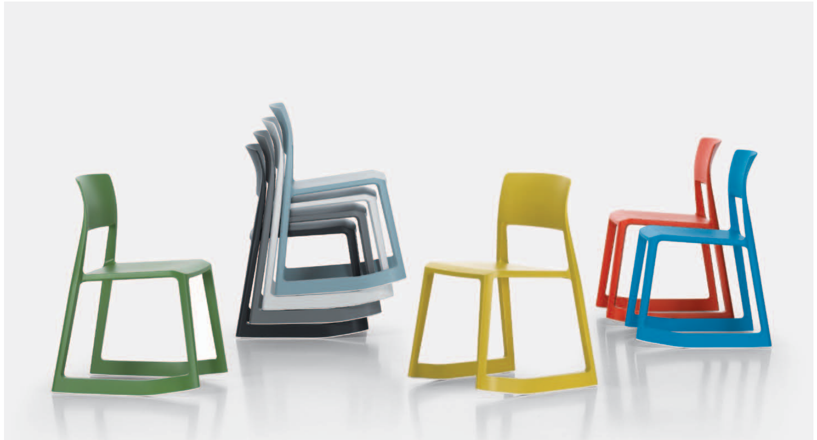
Tip Ton is available in eight different colours and can be stacked up to four chairs high.