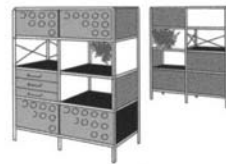
420.NC 47 1/2"w x 58 1/2"h x 16"d